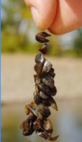
Juvenile Zebra Mussels are small