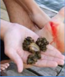
Zebra Mussels impact recreational use of lakes