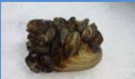
Zebra Mussels on a native clam - ALSO: Zebra Mussels deplete food supply for native fish

• Hire dock and boat lift installers that are DNR trained Lake Service Providers (LSP). It's the law for anyone working for hire in Minnesota public waters. The business needs a permit - the worker needs DNR certification. (DNR website - search LSP )