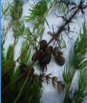
Zebra Mussels attach to plants