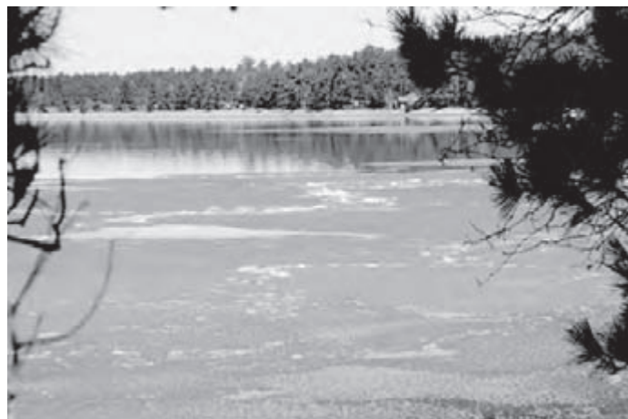
2012 Ice Out

Knowledge, understanding, and, personal involvement are the keys to success in meeting the Aquatic Invasive Species threat to our lakes. The State of Minnesota, the DNR, the individual counties and towns, the many lake associations, and, others cannot meet this problem alone. Let's jump on board as individuals and support their efforts. We cannot put this off until tomorrow.