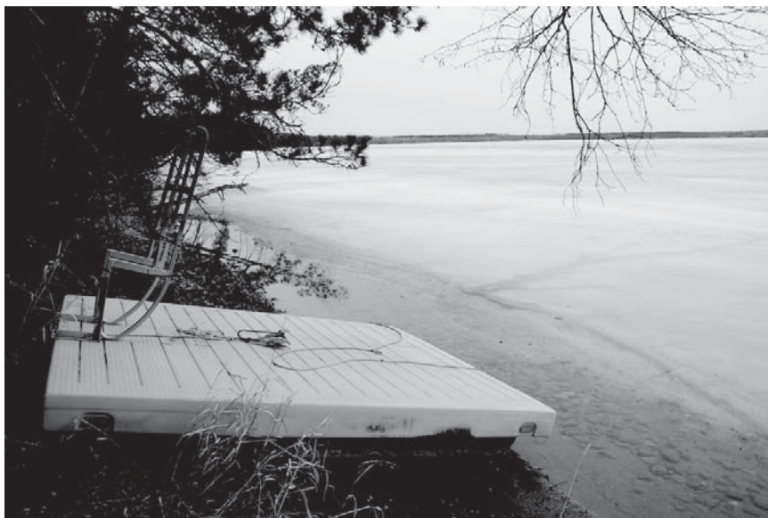
Swim Platform Awaits Ice-out

Thank you in advance for helping keep our directory current. While you are updating your contact information, you may also renew your BSLA membership (see previous article). Thank you!